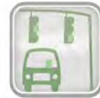
Transportation System Operations Analysis