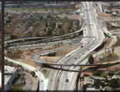
SR 22 Improvements - Orange County Transportation Authority