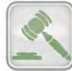
Transportation Policy Evaluation