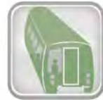
Transit Ridership Forecasting