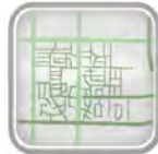
Travel Model Development