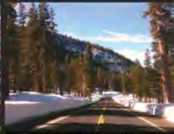
FHWA - Mammoth Scenic Loop - FHWA Central Federal Lands Highway Division