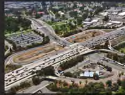
I-405 Sepulveda Pass Widening - Los Angeles County MTA

Auburn (530) 887-1494 Fresno (559) 438-8411 Modesto (209) 522-6273 West Sacramento (916) 375-8706 www.blackburnconsulting.com